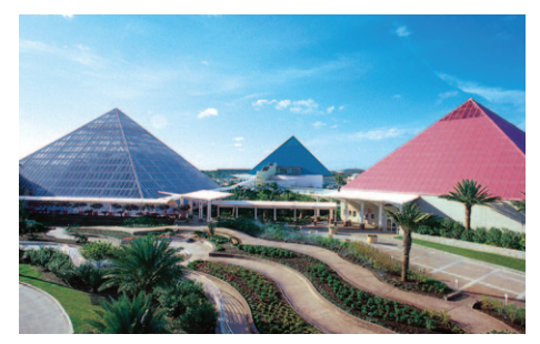
Moody Gardens Galveston Island, Texas

Built in 1999, the Pyramid Aquarium at Moody Gardens is a 1.5 million-gallon aquarium and a tribute to the North Pacific, Caribbean, Tropical Pacific and South Atlantic Oceans. The facility features close-up views of penguins, sharks, seals, sea horses, moray eels and much more. Moody Gardens hosts over two million guests a year and is an active participant in a waste water recovery project and has several initiatives to become a leader in sustainability efforts.