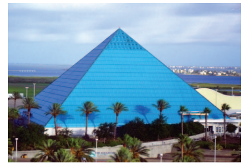
Pyramid Aquarium at Moody Gardens

Improving energy efficiency is a high a priority for Moody Gardens. Finding solutions that work in the harsh saltwater environment while maintaining the aquarium's critical life support exhibits has been difficult.