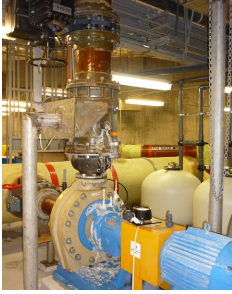
Original system layout with LimiTorque<sup>®</sup> control valve