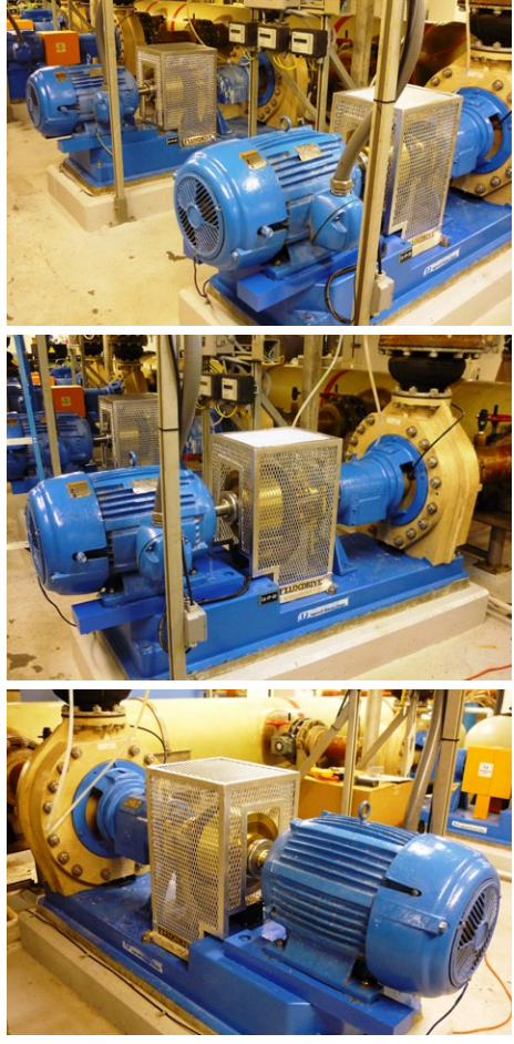
Flux Drive ASD Model 10 – 150 (50 hp) filter pump application at Moody Gardens

Moody Gardens has five (5), 1500 gpm — Ingersoll-Dresser filter pumps (Model GRP 8 x 6 x 13) and ten (10) Neptune - Benson sand filters servicing the Caribbean exhibit to provide continuous filtration. The aquarium exhibit is designed to have one pump provide water to two sand filters rated at a maximum flow rate of 750 gpm each. Filter flow is adjusted by one LimiTorque<sup>®</sup> control valve located at the pump discharge. A backwash procedure on the sand filters occurs once per week and requires full flow during that operation.