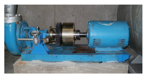
Main Pool Pump: Flux Drive Application